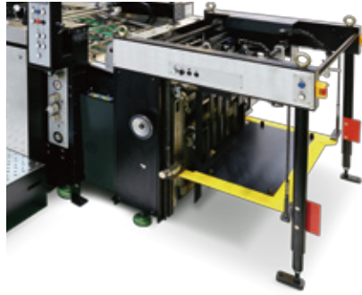
FP/t twin-flow Front Pick-up Feeder