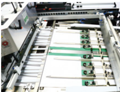
twin-flow in register