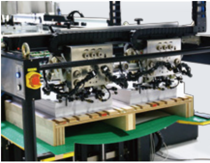
EP/t twin-flow Rear Pick-up Feeder with twin feeder heads