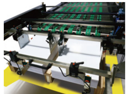
AS/t twin-flow Stacker handling twin stacking