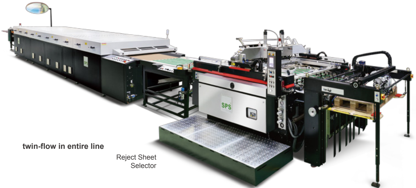
twin-flow in entire line